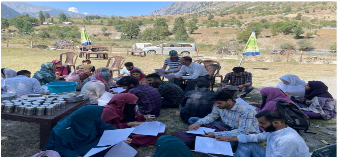
M.A./M.Sc. Geography Batch 2021 conducting field work in Gurez in 2023