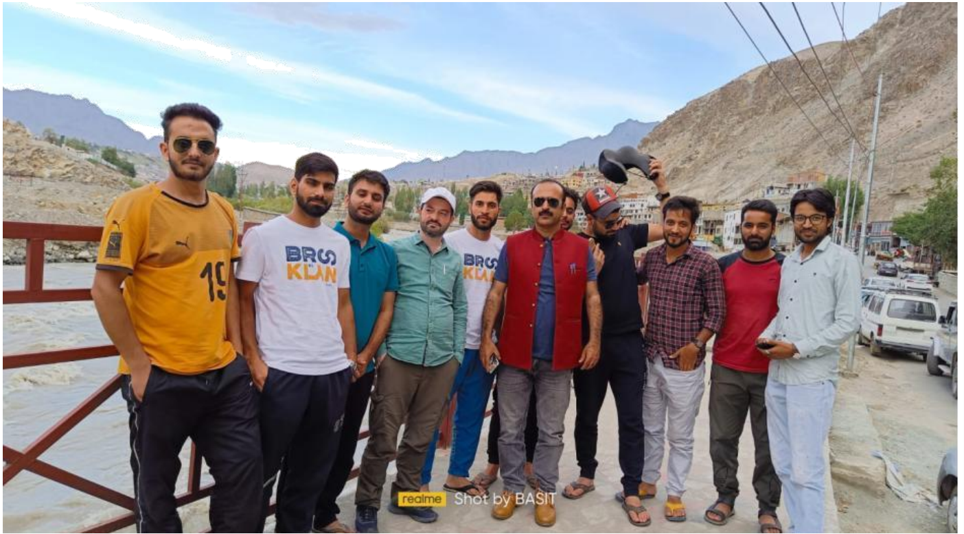
M.A./M.Sc. Disaster Management Batch 2020 conducting fieldwork in Kargil in 2022