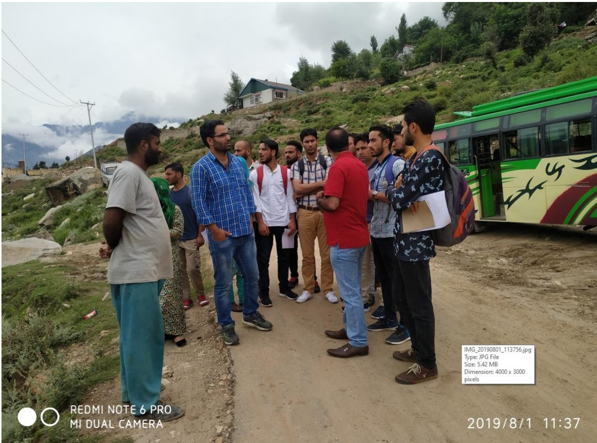
M.A./M.Sc. Disaster Management Batch 2020 conducting fieldwork in Kishtwar in 2019