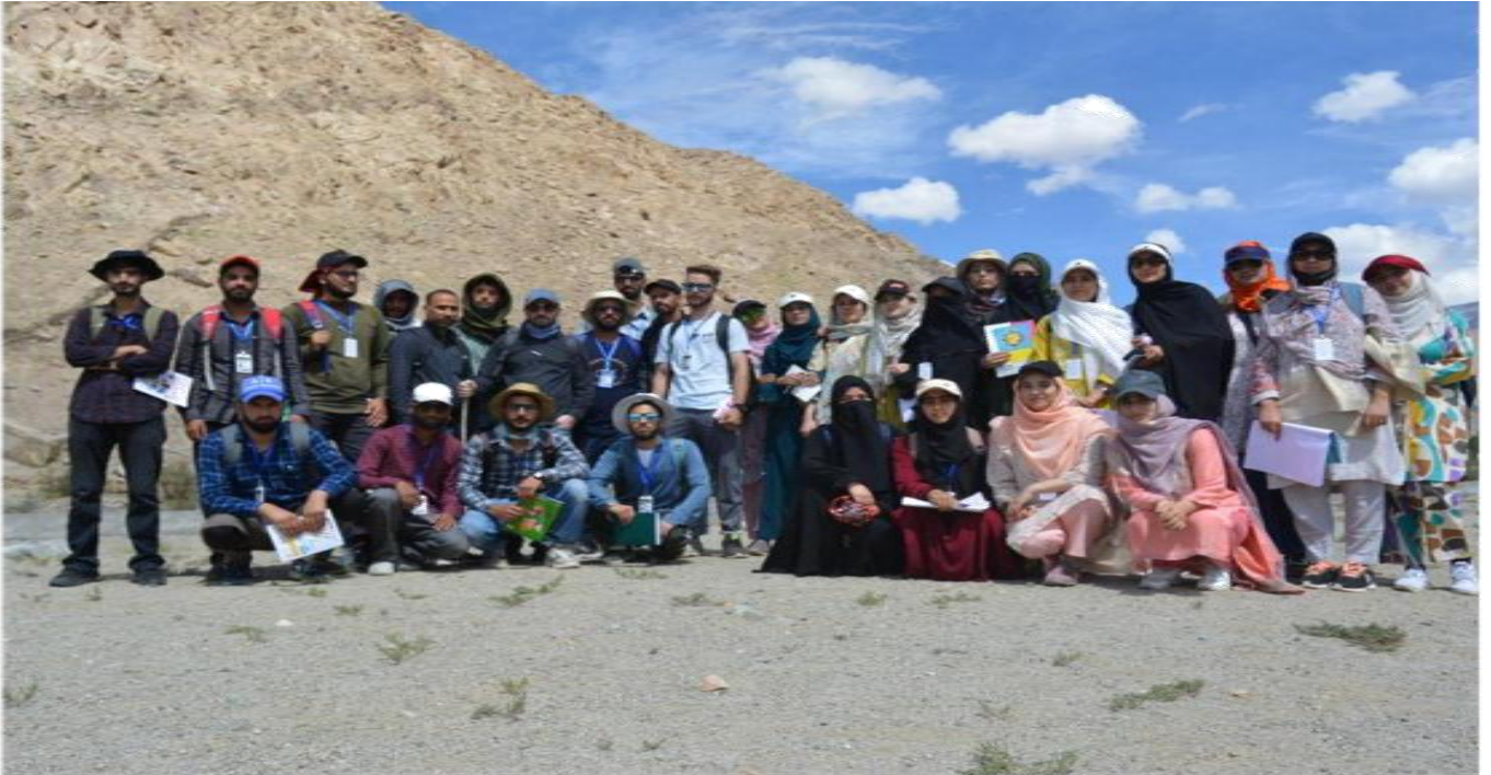
M.A./M.Sc. Disaster Management Batch 2021 conducting field work in Leh 2023